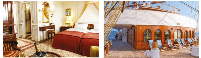
Sea Cloud II Junior suite (left) and sun deck (right)

Sea Cloud II is a three-masted sailing yacht steeped in the elegance of yesteryear and complemented with the most modern amenities. Sister ship of the legendary Sea Cloud , Sea Cloud II has 47 outside cabins and travels under 23 billowing sails trimmed by hand. From the mahogany-paneled library and gracious lounge to the gym and watersports platform, no detail has been overlooked. Praised by the world's most discerning travelers, Sea Cloud II receives consistent high rankings from Condé Nast Traveler . Passengers enjoy open seating at all meals and complimentary use of all water sports equipment. A doctor is on call 24 hours a day. Please note that there is no elevator on Sea Cloud II .