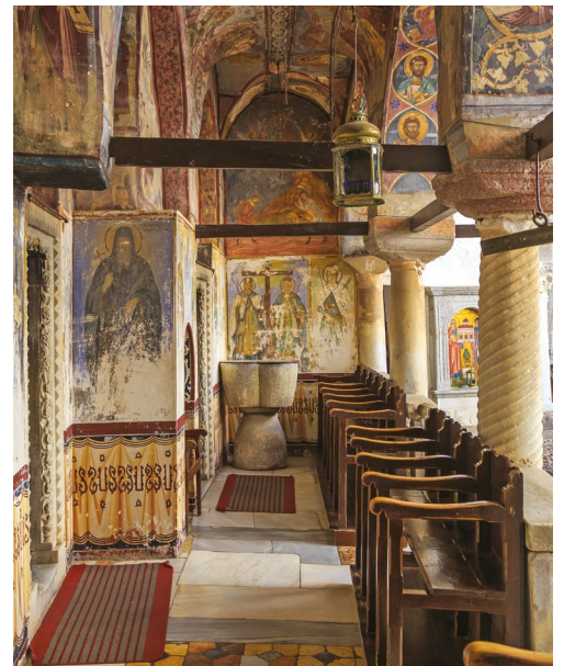
Photos clockwise from top right: Map of the region; Museum of Cycladic Art, Athens, Greece; Monastery of St. John, Patmos, Greece; Museum of the Acropolis, Athens, Greece; Sea Cloud II ; Santorini, Greece. Front cover: Windmill, Santorini, Greece. Back cover: Monastery of Hozoviotissa, Amorgos, Greece (top); Library of Celsus, Ephesus, Turkey (bottom).