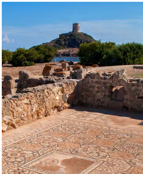
Ruins at Nora, Sardinia, Italy

Upon arrival in Tunis, join an expert guide for a tour of the ancient ruins and Roman villas of Carthage, founded by Phoenicians