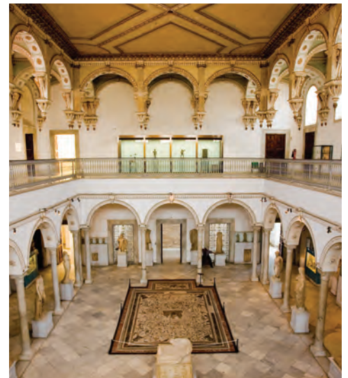
Bardo Museum, Tunis, Tunisia