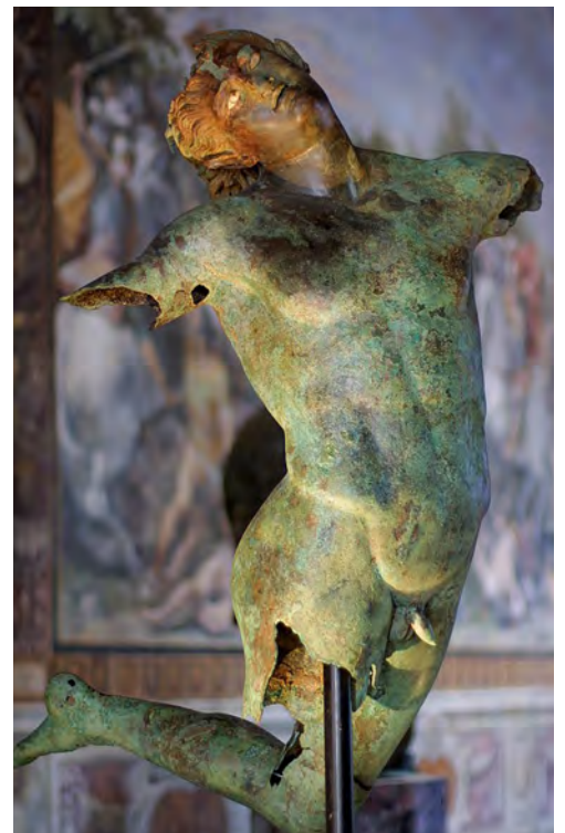
Photos clockwise from top right: Duomo di Cagliari, Cagliari, Sardinia; Sea Cloud II ; The Dancing Satyr , Mazara del Vallo, Sicily, Italy; Menorca, Spain; Tunis, Tunisia; Map of the region. Front cover: Trapani harbor, Sicily, Italy. Back cover: Zitouna Mosque, Tunis, Tunisia (top); and Valley of the Temples, Agrigento, Sicily, Italy (bottom).