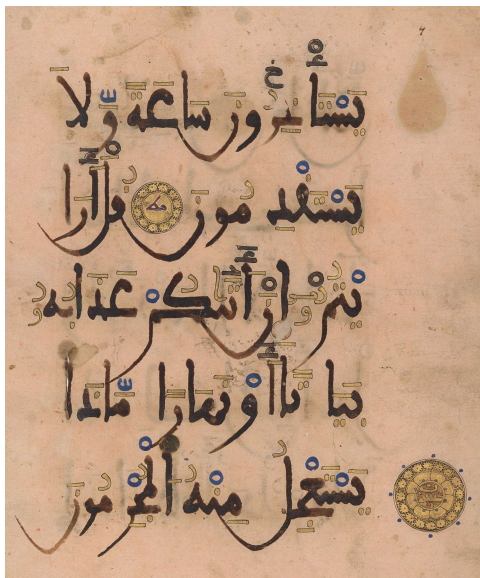
Bifolium from the Andalusian Pink Qur'an , 13th century, Spain, Ink, gold, silver, and opaque watercolor on paper, Purchase, Friends of Islamic Art Funds, 2017 (2017.232)

Calligraphy has been referred to as the most characteristic expression of the Islamic spirit and a key achievement of Islamic civilization. This exhibition will examine the inherent tension between textual design, decoration, readability and verbal clarity using works from the collection in a variety of media from the ninth century to the present. This exhibition is made possible by The Hagop Kevorkian Fund.